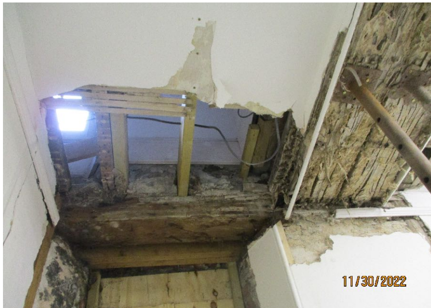
3. Ground floor - Main timber beam to be replaced and window lintel to be replaced. Affected timber to be removed and area treated for dry rot.