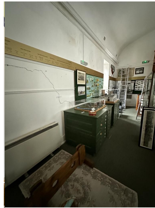
6. First floor - Cracking in primary wall above rotten beam. Wall supported with temporary works and needles while beam replaced with new steel beam. Cracking stitched