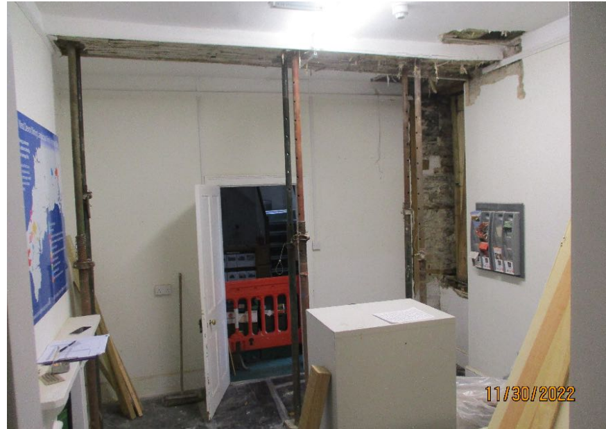
2. Ground floor -Main timber beam to be replaced - note existing timber stud wall to be removed to allow access /work space for temporary works and piling