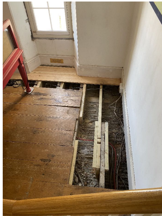
4. First floor - Existing poorly spliced joists replaced. Joist bearings resupported against external wall with new plate and hangers. Boarding made good