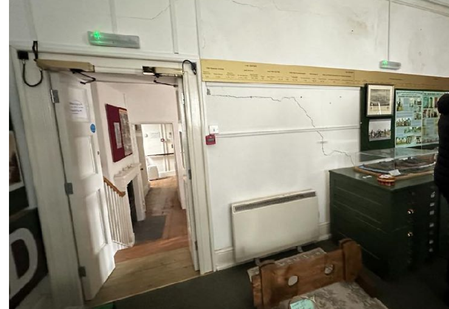
5. First floor - Existing door head supported with temporary propping and reinstated. Steps removed to allow temporary supports and reinstated