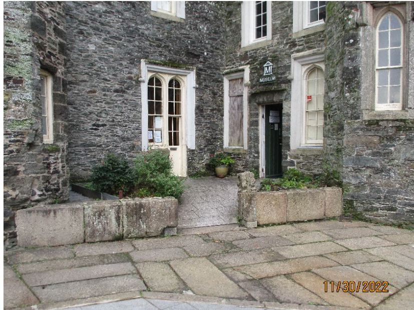
1. Museum entrance and forecourt - note access door size