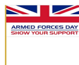
= Armed Forces Day Flag