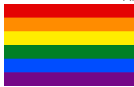
= Pride Flag