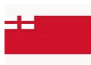
= Red Ensign