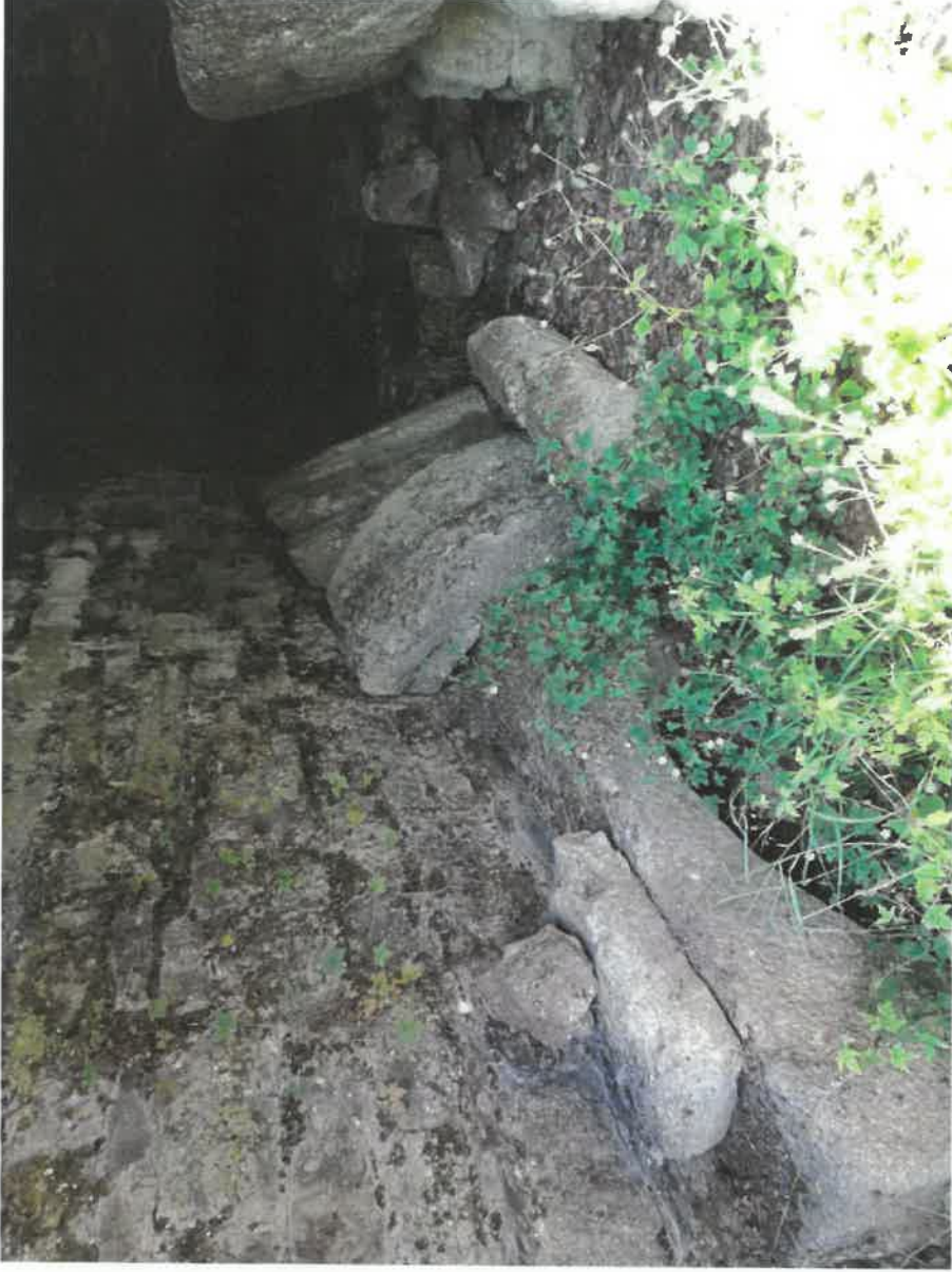
Remains of the abbey building deposited within without reference within Betsy Grimalb's Tower