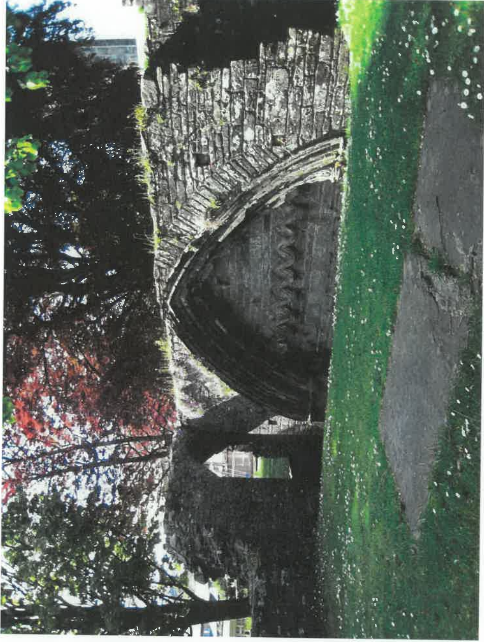
The cloister remains -the early mid-13 th century is visible in the detailing in the opening in the south wall of the cloister remains giving some idea of how ornate the church, which was dedicated in 1318, would have appeared with grand flamboyant and geometric detailing.