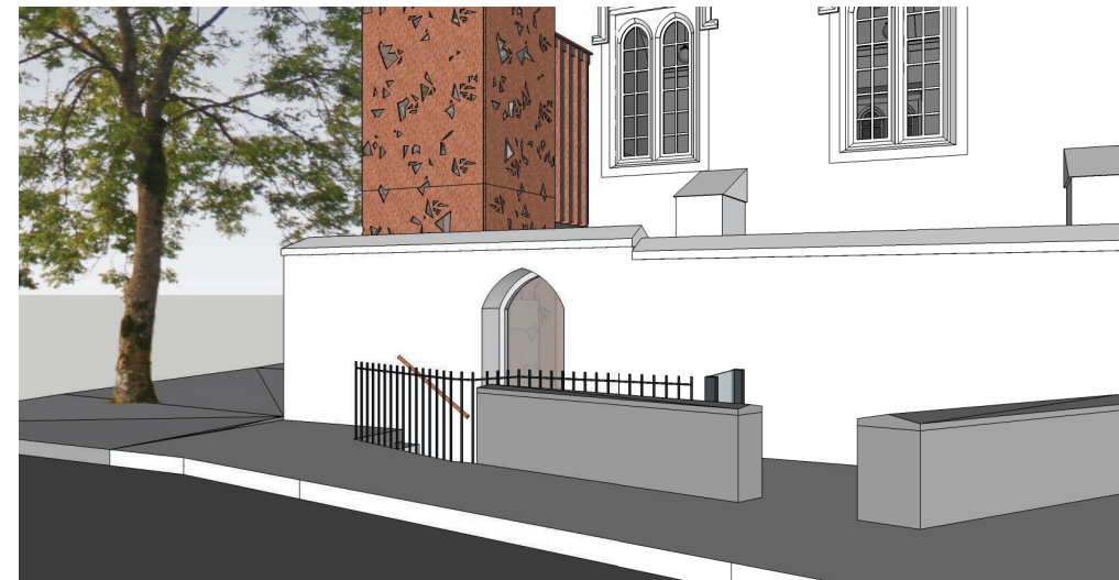
Sketch Model View 1