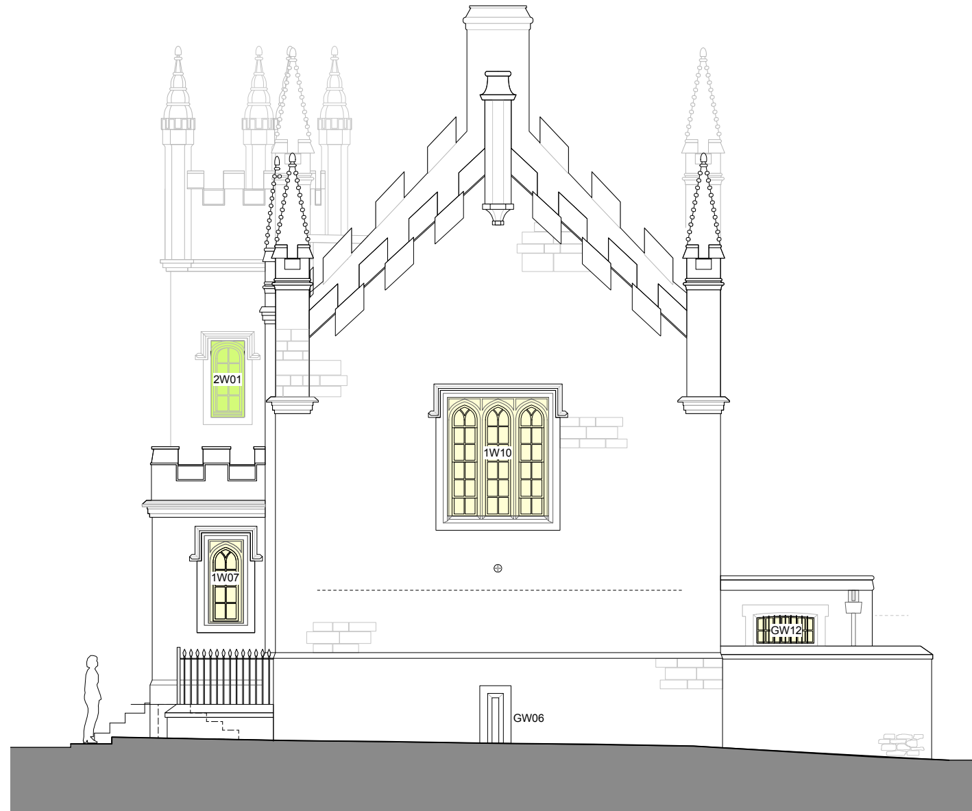
tavistock guildhall TTC: south elevation - as proposed

Existing window requiring metal bars to be removed and existing surrounds to be made good.